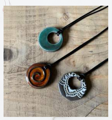
Unusual gifts that are little different...

Inca Pottery is a small, independent business local to Sevenoaks. The online shop offers a range of handmade stoneware ceramics in various colours, providing pieces to suit every space. It's all dishwasher, microwave and oven safe.