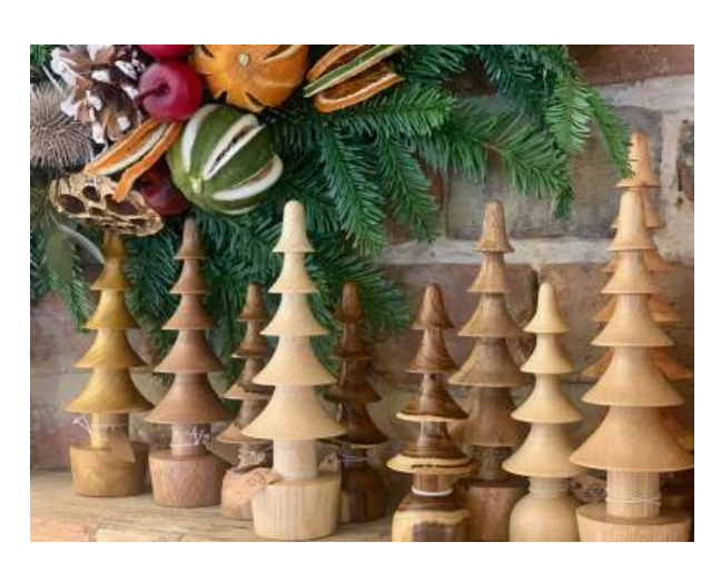
Wooden tree made locally \underline{\text{CHIC}\,\text{ET}\,\text{TRALALA}} \underline{\text{from}\,\mathcal{L}9}