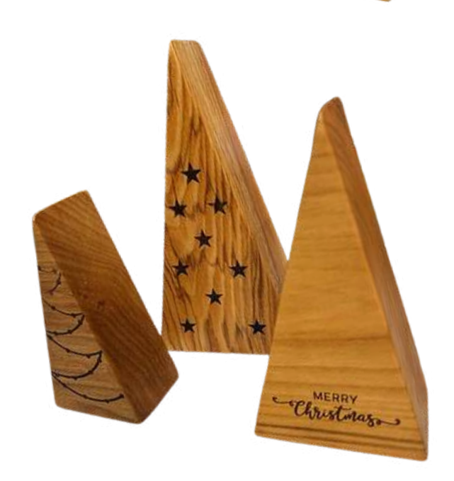
Trio of English hardwood laser etched Christmas trees. SAWNBY SARAH