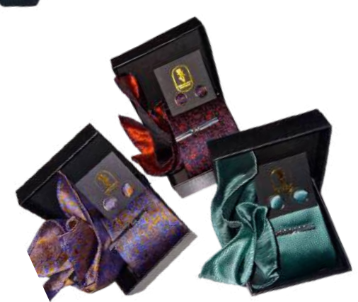
Tie/ pocket square/ cufflink/ tie clip sets. 15 colours available.